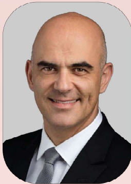
Mr. Alain Berset President of Switzerland.