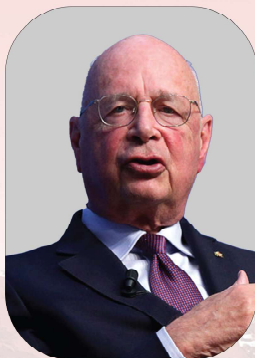
Prof. Dr. Klaus Schwab Founder & Executive Chairman, World Economic Forum.