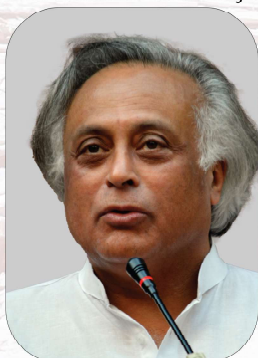
Mr. Jairam Ramesh Former Union Minister, Govt of India.