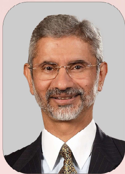
Dr. S. Jaishankar External Affairs Minister of India.

The following are the High Profile Resource Persons we have in mind. They will be contacted, confirmed and officially communicated before January 31, 2024.