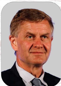
Mr. Erik Solheim Former Foreign Minister of Norway, President of Green Belt and Road Institute.