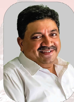
Dr. P. Thiaga Rajan Minister of Information Technology and Digital Services, Govt of Tamil Nadu.