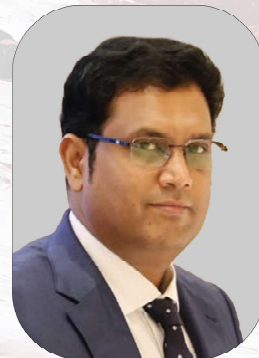
Dr. TRB Rajaa Minister of Industries, Govt of Tamil Nadu.