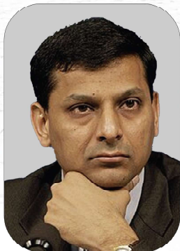
Dr. Raghuram Rajan Former Governor of RBI 7th Chief Economist of the International Monetary Fund.