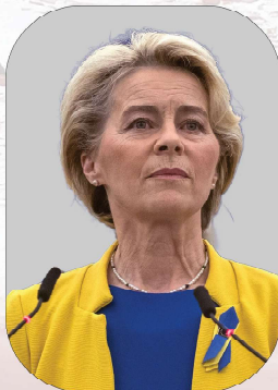
Mrs. Ursula Von der Leyen President, European Union Parliament.