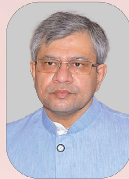
Mr. Ashwini Vaishnaw IAS Minister of Communication, Electronics and Information, Govt of India.